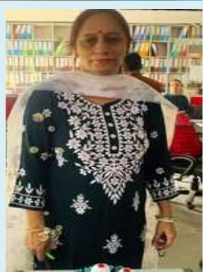
Birthdays at Sites