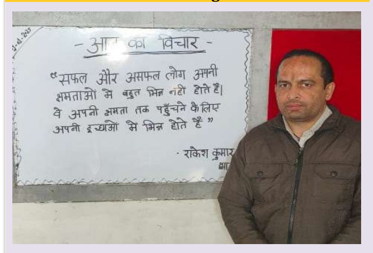
Life at AGGCON is all about fostering positivity and embracing progressive thinking.

Each day begins with a team member sharing an inspiring thought on our board, encouraging everyone to reflect and start the day on an uplifting note. This culture of positivity empowers us to serve our customers with unwavering excellence and trust.